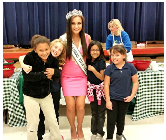
Also attending the Taste Test activity was "Miss Kansas Teen USA" who spoke with each class about proper nutrition.